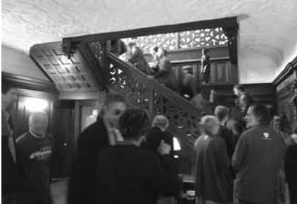
Marching into the President's office

inside filled the lobby, the stairs and the upper hallway.