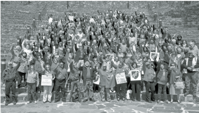
Montclair State University rally start

What follows are brief descriptions of the activities at each campus: