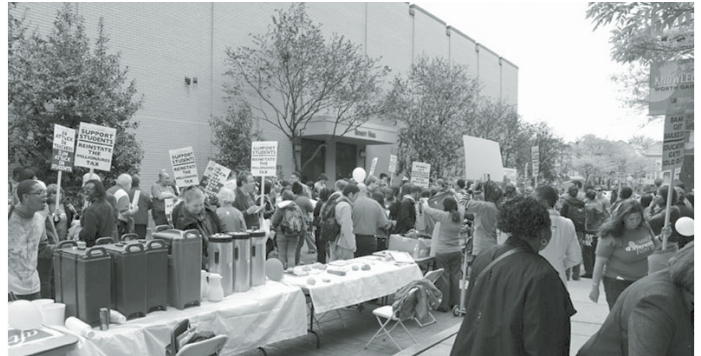
NJCU Photo by Debra Jenks