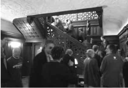
Marching into the President's office

inside filled the lobby, the stairs and the upper hallway.